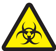
Figure 1: Biohazard sign

Biological waste should be clearly labelled with a biohazard label so as to enable safe collection and disposal (see figure 1), There are strict requirements in place for the transportation of such waste through the ADR legislation.