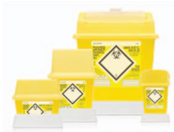
Figure 2 – Examples of Sharps Disposal Containers

Biologically contaminated needle and blade waste should be collected for disposal in a suitable needle and blade waste container, see figure 2 below for some examples.